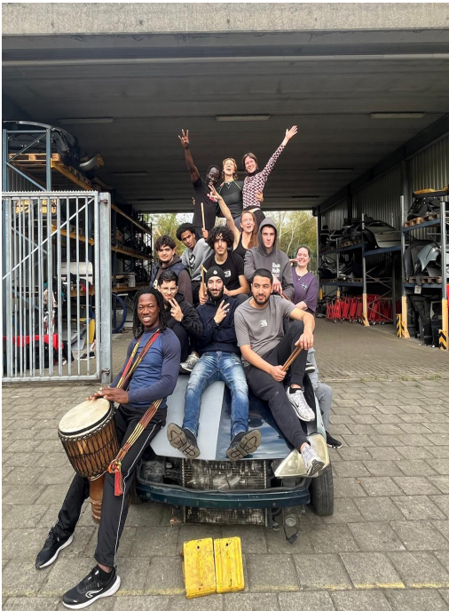
Connect for Global Change (with Amoukanama) in Tectum - Antwerp

In 2025, many young Belgians had the opportunity to meet peers from other contexts through the Youth2Youth project . Youth from Brussels exchange twice with participants from Rio de Janeiro. During the first exchange, they shared insights about their respective contexts and the opportunities they see in their countries. In the second exchange, they focused more closely on the challenges such as discrimination and safety in their living environments, and discussed how they could address them. In Antwerp, youth exchanged with young participants from Burundi, focusing on environmental awareness and climate action.