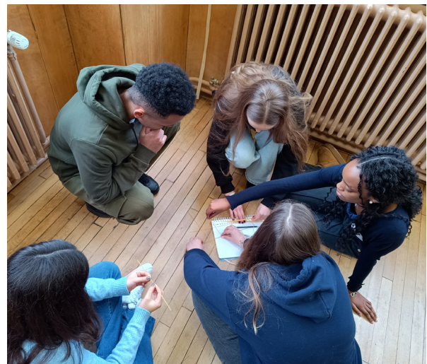
Session on talents with the youth of the Boost project

Following the successful 'Circus4Climate' project, KIYO built on one of the key lessons learned in 2025: art can be a powerful tool to engage young people in global citizenship topics. Together with the circus company Amoukanama , we worked with young people in Antwerp who are prepared for the labour market to create a circus performance at school. The participants explored themes related to climate change and integrated them into various circus acts under professional guidance. Although many of them started the week feeling uncertain, they gained confidence throughout the process and delivered an impressive final performance that was warmly applauded by students and teachers. In 2025, KIYO also continued its collaboration with the King Baudouin Foundation through the Boost