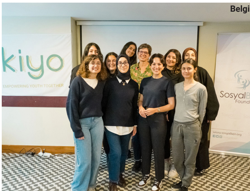
Workshop on Global Citizenship Education with SosyalBen