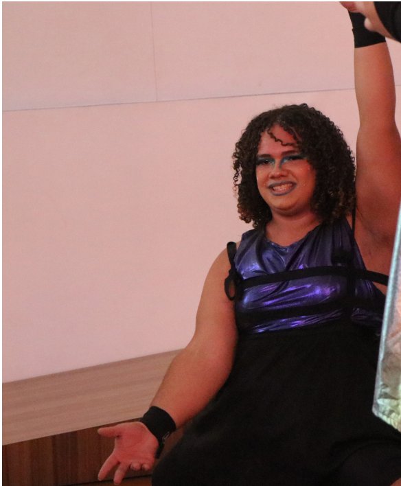
Social Circus Arts by SeEssaRuaONG