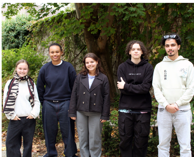
Youca Action Day