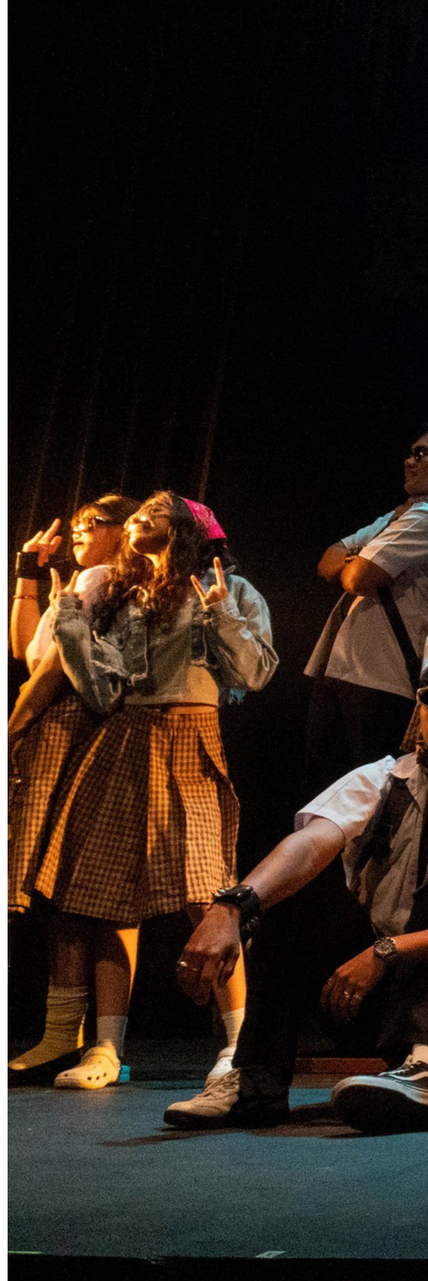
PETA Goldmine Youth Theater Festival Philippines 20

I believe that many of us will continue, because what we built the past years was not only momentum, but also ownership. ”