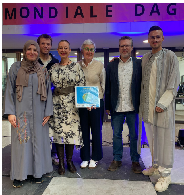
Annual Globay Day in 'De Stemstroom' in Antwerpen