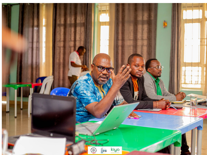
Workshop with ADED and ASCEN teams reviewing the programmes' 2025 actions and results.

'Through our partnership with KIYO, we have strengthened our approach to youth empowerment programming. Working in an environment based on trust and equal partnership helped us build confidence in our expertise and take greater initiative in planning, monitoring, and reporting. Regular exchanges also improved coordination with field teams and community structures while integrating transversal themes such as gender equality, inclusion, and environmental awareness. Today, ASCEN continues to support young people by building on their talents and capacities while responding to local realities.'