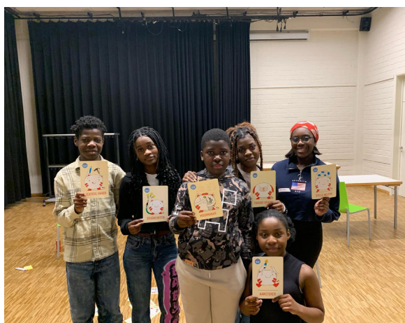
Discovery of talents NAB «youth» day

UCOS and KIYO continued to work together on integrating a children’s rights lens into international mobility. For both students and accompanying staff in higher education institutions.