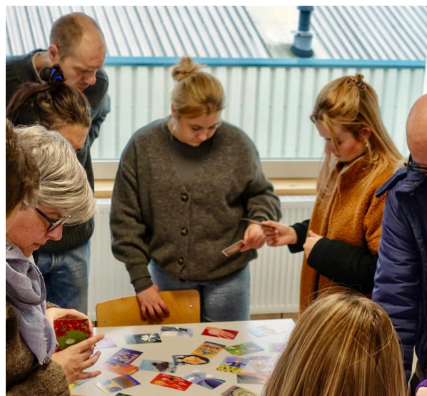
Masterclass School for Rights in KA Geraardsbergen

dents took part in all kinds of workshops (cooking, henna, dance, etc.) and got to know each other and each other's backgrounds better. This day brought together many of the things that had been worked on during the School for Rights program, including increased student participation, celebrating diversity, and working on connections between students and teachers. The school can be proud of the progress it has made over the past three years. The school radiates its vision of children's rights and global citizenship, and through the Smakelijke School (Tasty School) project, which offers free fruit, soup, and bread to students every week, the school also focuses on healthy nutrition. With this label in hand, future initiatives around global citizenship are also assured.