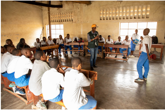
Discussion on the comic book