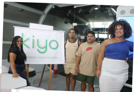
Current members of the Governance Board