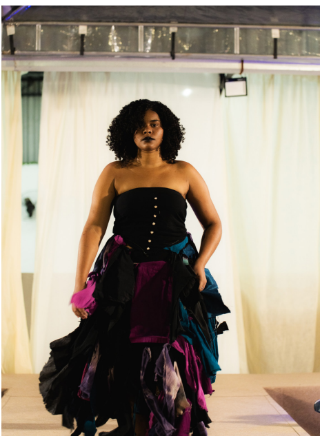
Fashion Show with Jardim Gramacho's youth

SER supported four public schools in fostering a school culture that prioritises children's rights, encourages active participation, and embraces diversity. Through its social circus and arts-based methodology , SER worked directly within schools to integrate artistic practices into the pedagogical routine, strengthening students' sense of belonging and reducing discrimination. Schools reported that these activities created safe spaces for dialogue and collective reflection, enabling discussions on discrimination against young Afro-Brazilians, gender equality, diversity and inclusion, drug abuse, and climate change. SER also supported five youth cultural organisations through exchange meetings and training on rights, diversity, cultural management, and creative professionalisation, expanding opportunities for young artists to access cultural policies and income-generating activities. Through its partnership with KIYO, YOUCA Brasil strengthened 13 youth-led organisations , supporting young people in developing skills in leadership, internet security, youth rights,