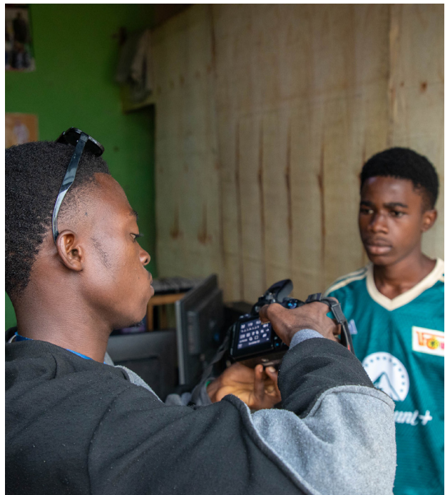
Kennedy - Photography workshop