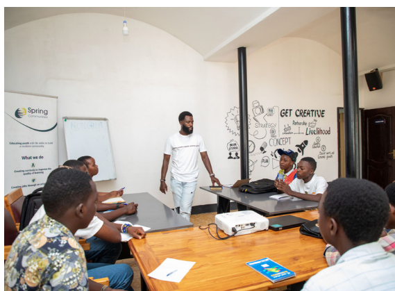
Photography & Art activities

Their members have increased their savings by 25% and created 229 jobs , including 30