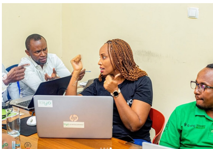
Training on Accounting System for Non-Profit Organizations