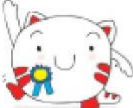
UITBLINKER ALS IK DAT WIL